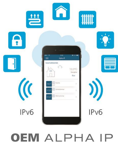
Image 1: Möhlenhoff's innovative OEM Alpha IP home automation system is based on eQ-3's Homematic IP communication protocol.