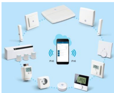
Image 2: Möhlenhoff's Alpha IP range provides the ideal basis for numerous combinations and expansions.

Image 1: Möhlenhoff's innovative OEM Alpha IP home automation system is based on eQ-3's Homematic IP communication protocol.